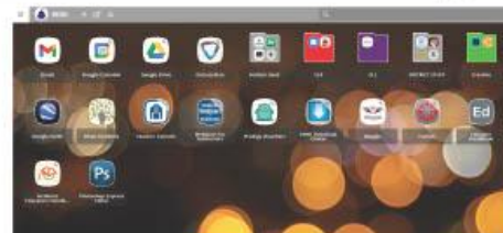
Example of ClassLink page with program icons