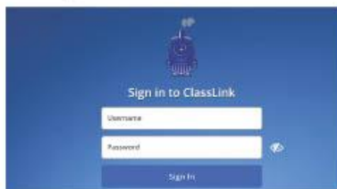
Example of BESD ClassLink Login page